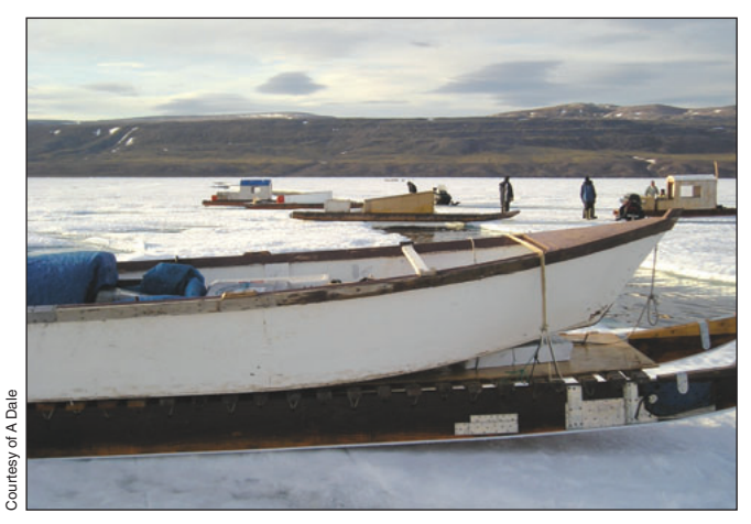
Figure 2. A hunting party traveling in uncertain sea ice conditions. Here, the knowledge and experience of local hunters are essential.