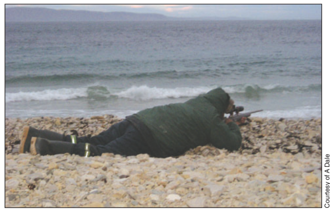
Figure 4. An Inuit hunter on the lookout. Less powerful groups require particular attention in co-management arrangements.

Third, assessment in adaptive co-management should take into account the specific context, uncertainties, and objectives prior to determining what outcomes will be monitored. This extends to the consideration of the role of different organizations in determining what questions to ask, what outcomes to encourage, and the choice of indicators used to assess outcomes (as previously noted), as well as the use of participatory processes for indicator development and monitoring (Prabhu et al. 2001; Garaway and Arthur 2004). Ultimately, to facilitate systematic assessment and learning across sites, consistent parameter and indicator selection is required.