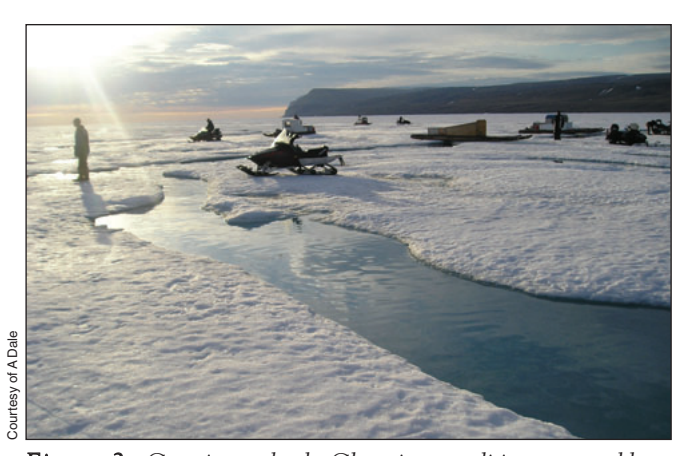
Figure 3. Crossing a lead. Changing conditions can add an additional layer of uncertainty for local harvesters and may require the adoption of new technologies.

Third, careful attention to how learning is defined and conceptualized is critical, because learning theories are drawn from diverse disciplines and have various process and outcome implications (Parson and Clark 1995). What is apparent is that adaptive co-management requires a model of learning that accounts for social context (eg conflict and power imbalances), pluralism, critical reflection,