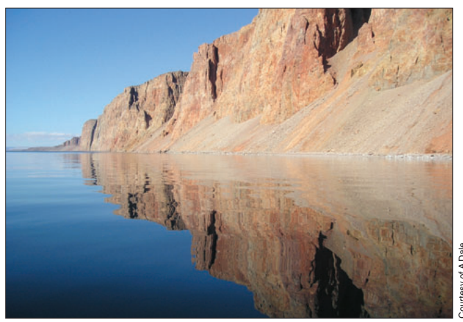
Figure 5. The terrestrial—marine interface deepens social—ecological complexity.

Many of the conditions identified above highlight key policy directions. These include more attention to assessment, directing additional funds to building the social sources of learning and adaptation, fostering flexible institutions and bureaucracies designed to work in a rapidly changing world, using the full range of knowledge sources, and explicitly considering the role of power. Other requirements will emerge with additional experience and as a result of tests of adaptive co-management in a variety of social–ecological contexts. What is clear,